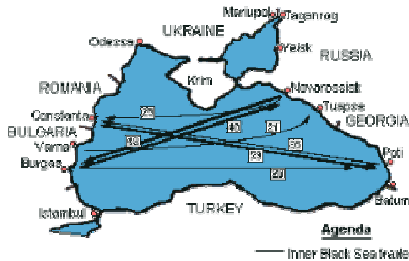
1995: Inner Black Sea - Main Tanker Routes (20 and more tankers)