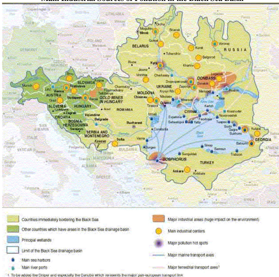
Main Industrial Sources of Pollution in the Black Sea Basin